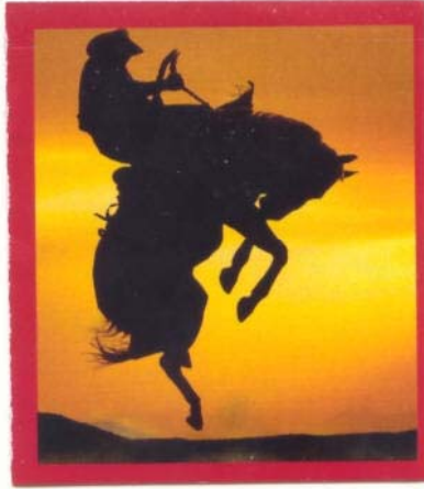
Cowboy Breaking Bucking Bronco