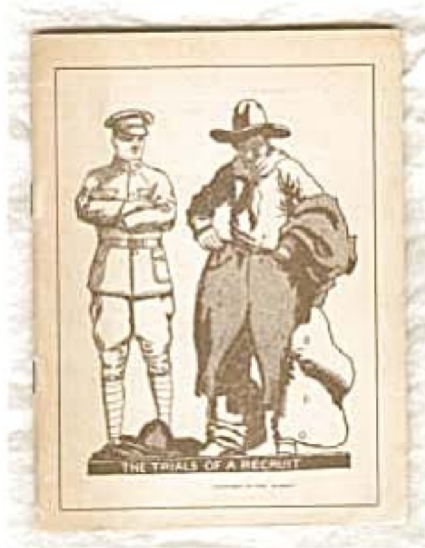
A Cowboy Becomes a Soldier: The Trials of a Recruit